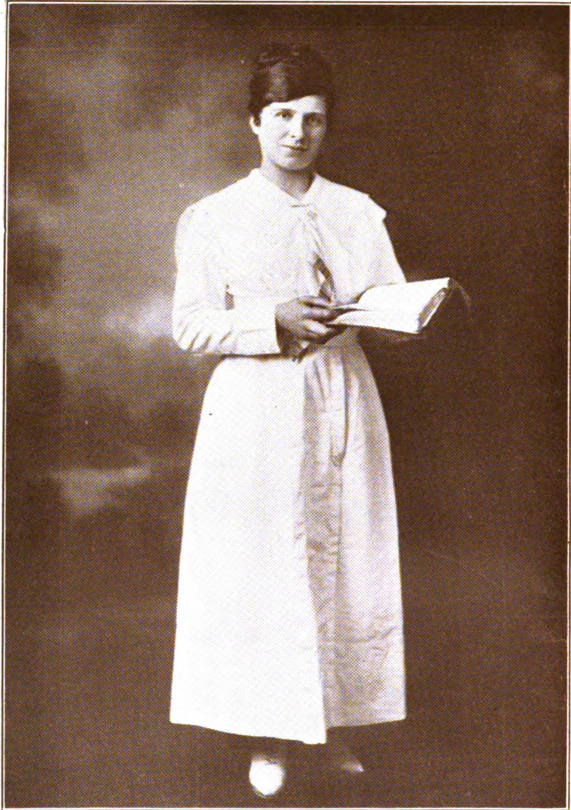
Your Sister in the King's Glad Service.